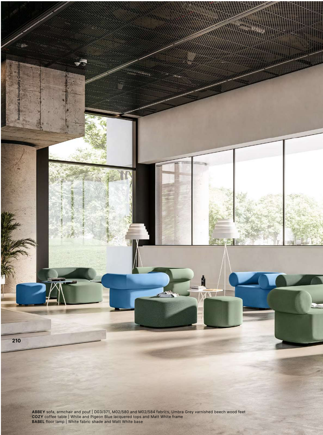
ABBEY sofa, armchair and pouf | D03/371, M02/580 and M02/584 fabrics, Umbra Grey varnished beech wood feet COZY coffee table | White and Pigeon Blue lacquered tops and Matt White frame BABEL floor lamp | White fabric shade and Matt White base