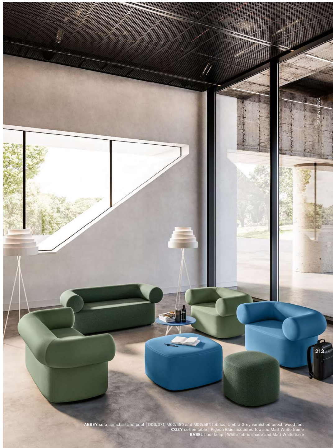
ABBEEY sofa, armchair and pouf | D03/371, M02/580 and M02/584 fabrics, Umbra Grey varnished beech wood feet COZY coffee table | Pigeon Blue lacquered top and Matt White frame BABEL floor lamp | White fabric shade and Matt White base

Ogni pezzo della linea Abbey è arricchito da cuciture a vista artigianali, volutamente imperfette per evidenziare il lato umano e caloroso del design, di cui questa collezione si fa portavoce con la sua esistenza.