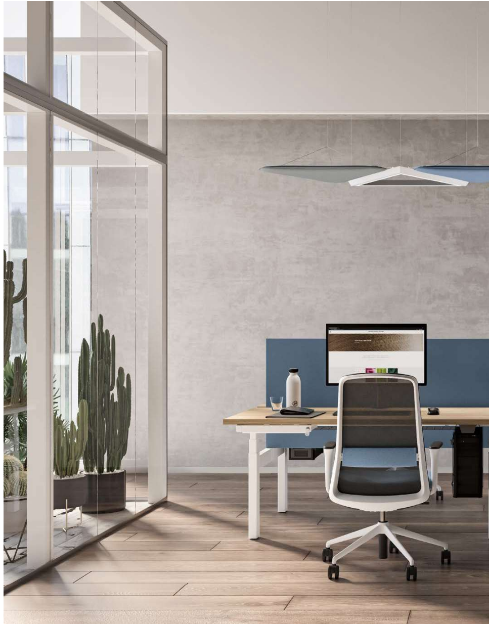
DIADE ROCK task chair | B01/014 fabric and R09/361 mesh, White frame UP&UP bench desk | Elm top, White legs and B01/014 fabric screen LIGHTSOUND system | B01/014 and B01/012 Cloak panels and Matt White Triangle lamps