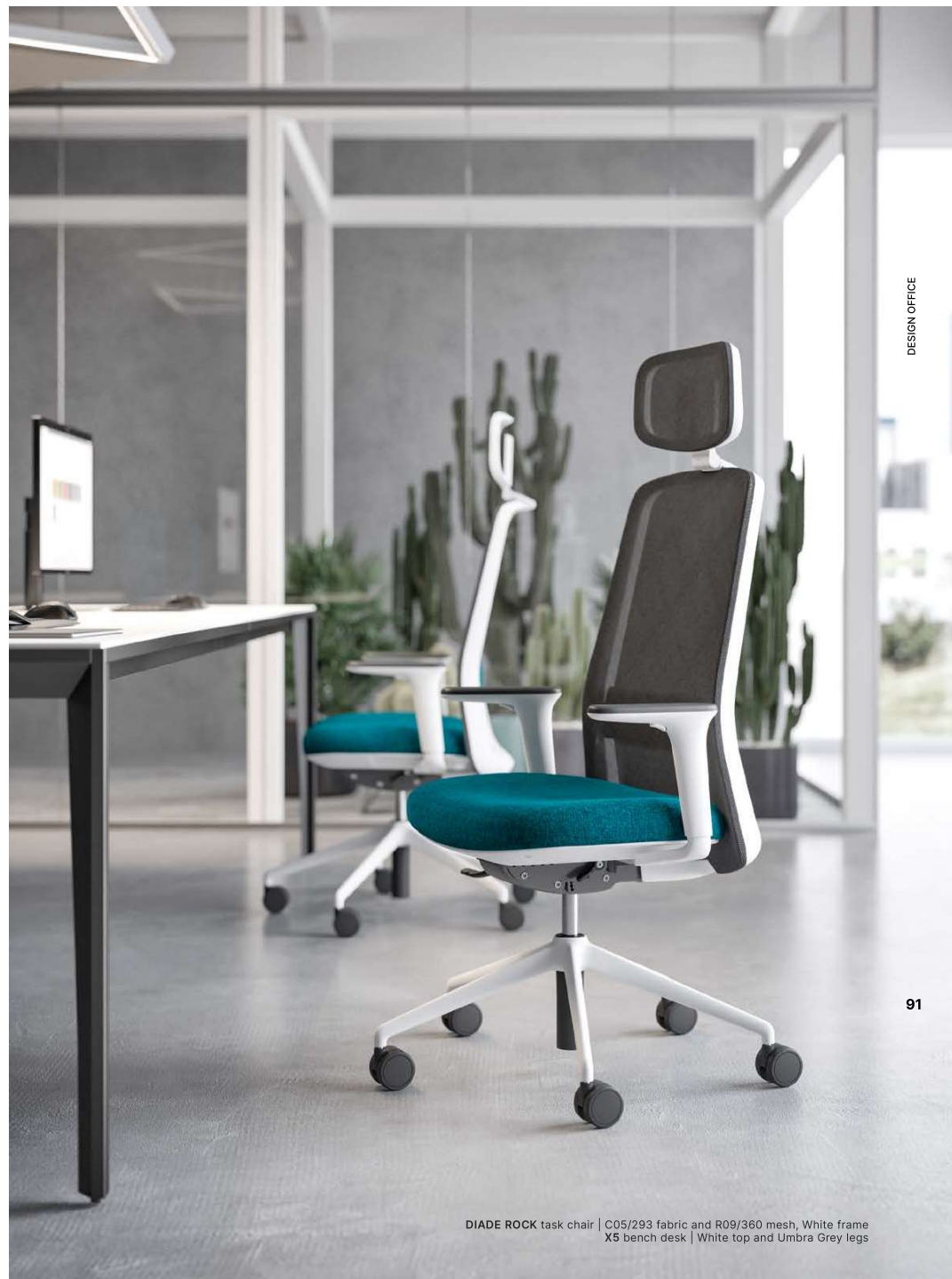
DIADE ROCK task chair | C05/293 fabric and R09/360 mesh, White frame X5 bench desk | White top and Umbra Grey legs