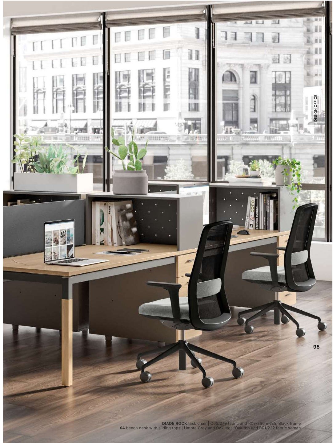
DIADE ROCK task chair | C05/279 fabric and R09/360 mesh, Black frame X4 bench desk with sliding tops | Umbra Grey and Oak legs, Oak top and B01/222 fabric screen