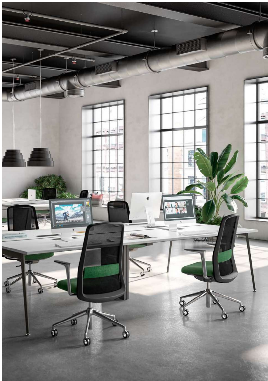
DIADE ROCK task chair | C05/303 fabric and R09/360 mesh, Black backrest, Chrome base and arms X3 bench desk | White top, Umbra Grey legs BABEL pendant lamp | Black fabric shade

The seat is fitted with a lumbar support that can be adjusted to meet all comfort requirements. Leather or fabric upholstery covers are available, for a matching seat with an original style.