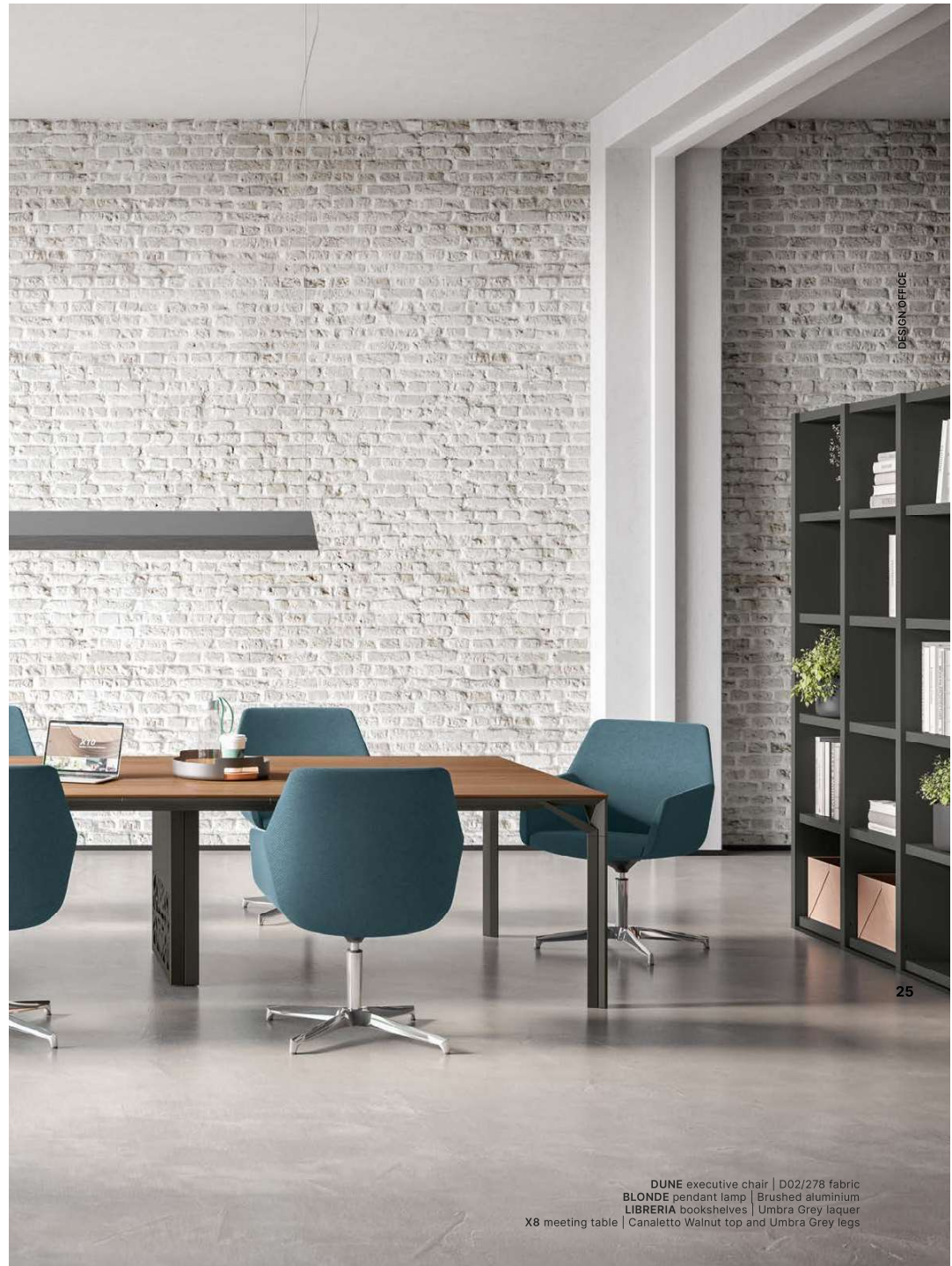
DUNE executive chair | D02/278 fabric BLONDE pendant lamp | Brushed aluminium LIBERIA bookshelves | Umbra Grey laquer X8 meeting table | Canaletto Walnut top and Umbra Grey legs