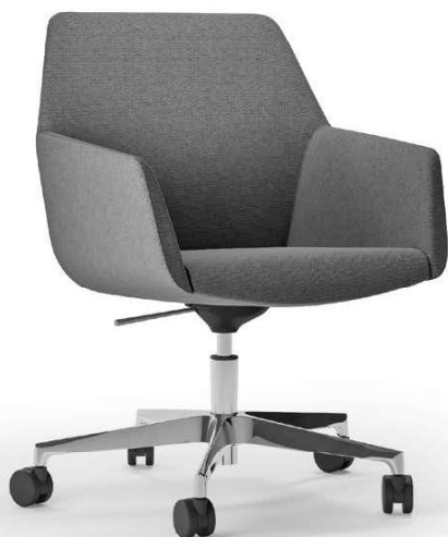
DUNE executive chair | D02/273 fabric

Dune è disponibile con schienale alto con poggiatesta, alto o basso: mantiene immutato il suo comfort e diventa il naturale completamento di una scrivania o di un tavolo riunioni.