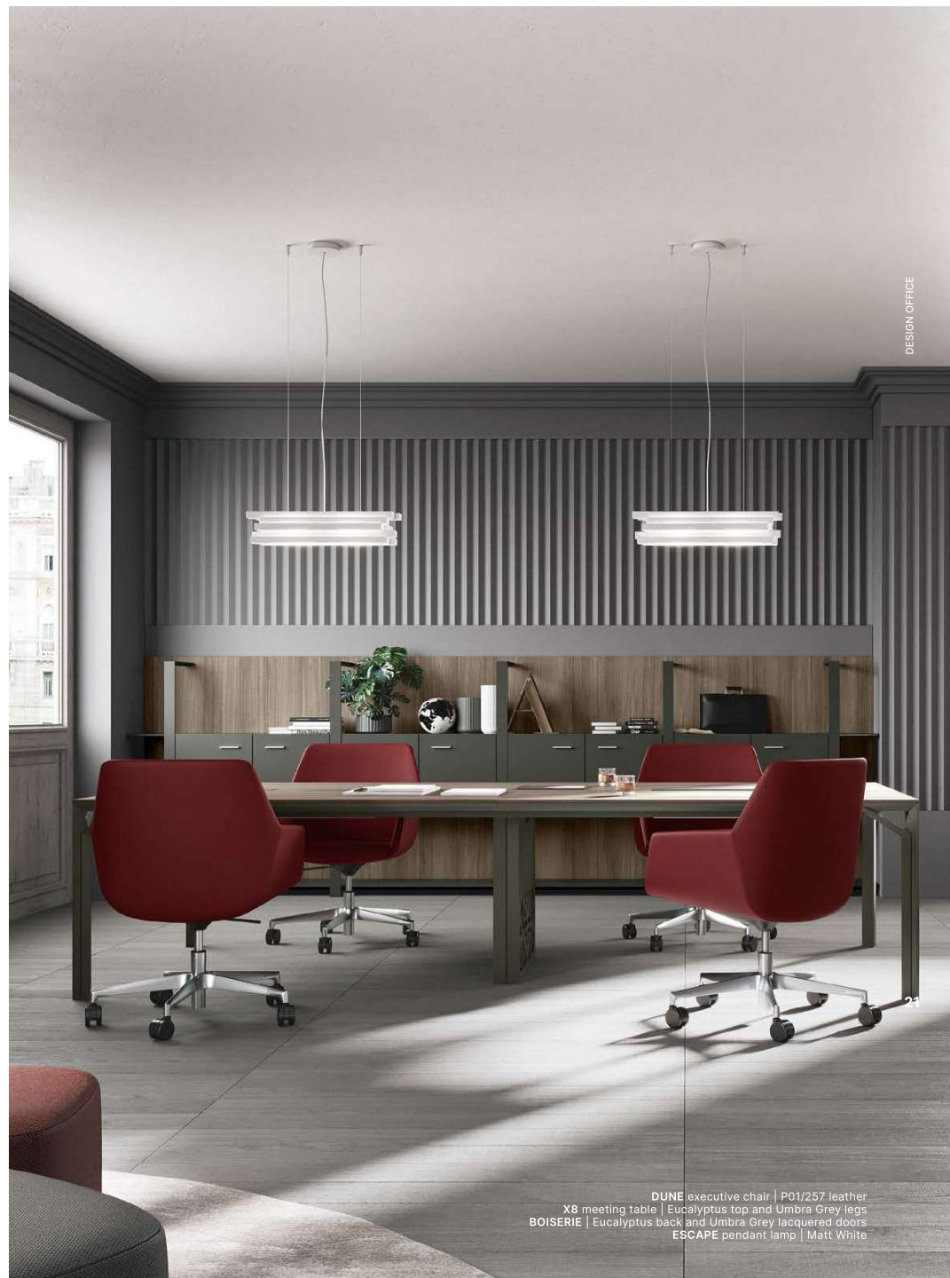
DUNE executive chair | P01/257 leather X8 meeting table | Eucalyptus top and Umbra Grey legs BOISERIE | Eucalyptus back and Umbra Grey lacquered doors ESCAPE pendant lamp | Matt White