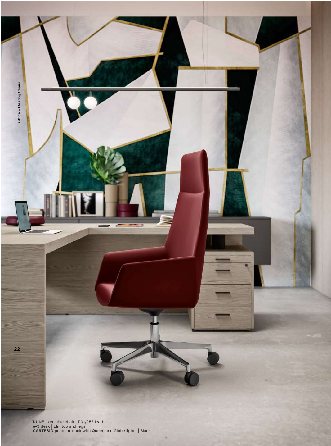
DUNE executive chair | P01/257 leather e-9 desk | Elm top and legs CARTESIO pendant track with Queen and Globe lights | Black

The soft style of the seat takes centre stage in any setting: materials, finishings and colours are customisable, enhancing shared and executive interiors. Welcoming and welcomed: this is what you feel when you sit on Dune.