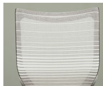
Mesh Type : Gradation Support