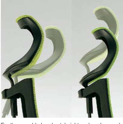
For the movable headrest, height and angles can be adjusted.