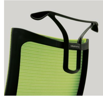
You can add an optional upper garment hanger to your chair, either to the chair's high-back or low-back variation.