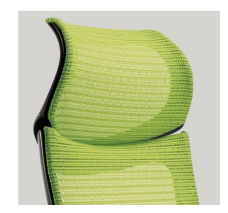
A wide headrest gently supports the back of the head. A movable and fixed type is available.