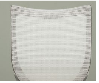
Mesh Type : Standard