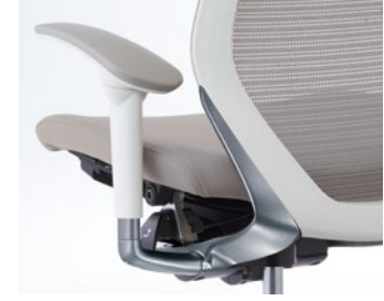
ody Color: White / Frame Color: Silv