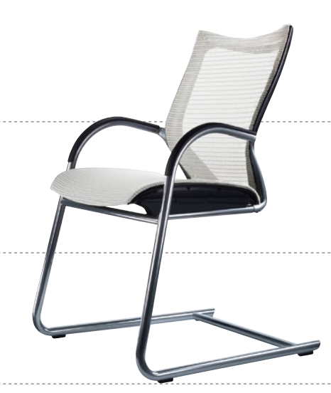
Guest Chair (chrome)