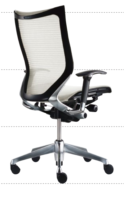
High Back with Armrest