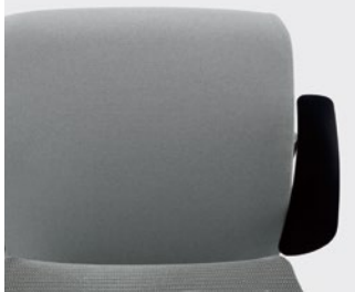
Seat Type : Fabric