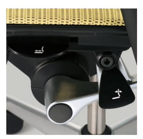
Levers within easy reach of hands enables you to easily slide the seat backward and forward up to 2inches(50mm).