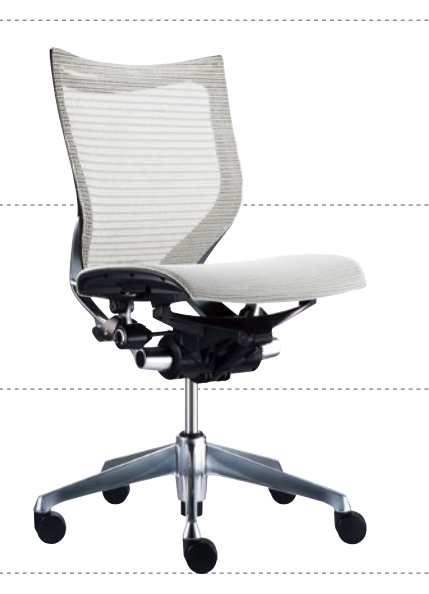
Low Back without Armrest