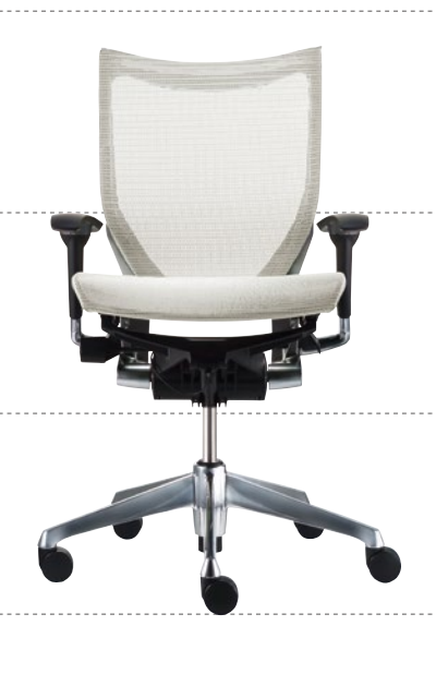
Low Back with Armrest