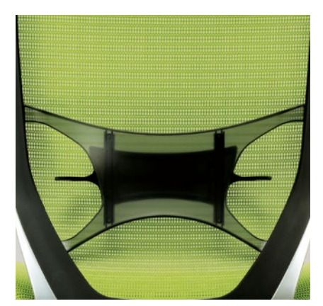
Featuring a stylish half-transparent design, the lumbar support comfortably conforms to your physique and provides back support. You can adjust the height of the lumbar support up to 2inches(50mm).