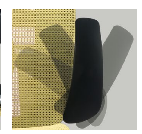
You can adjust the arm pads in 30° increments up to 90° (two inward settings and one outer setting) to give you comfortable elbow support when using a computer or doing other tasks.