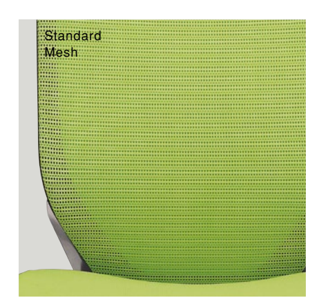
Standard mesh chairs with moderate resiliency that firmly support your body. The exceptional breathability provides comfort even after long hours of sitting.

Newly developed mesh materials and OKAMURA CP's advanced design provides the most comfortable seating for wide range of physique, guaranteeing fatigue-free support and stability even after hours of sitting.