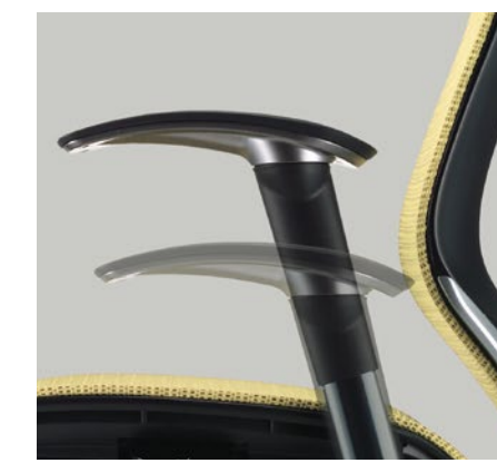
You can easily adjust the position of the ratchetstyle armrests up or down to a maximum 4inches(100mm).