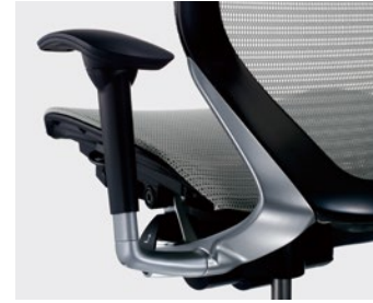
Body Color : Black / Frame Color : Silv