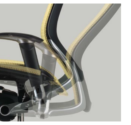
You can use the lever on the lower left to either set the recliner to move freely with your body motion or lock it at your favorite angle to a maximum of 23°.

2. Naturally comfortable seating and ergonomically smart operation Comfortable reclining is another remarkable feature that makes OKAMURA CP such a pleasure to sit in. OKAMURA CP's unique ankle tilt reclining mechanism naturally follows bodily movement even while working at a computer. Ease of operation and easy to use controls enables the user to adjust seat height and reclining angle to his or her natural posture.