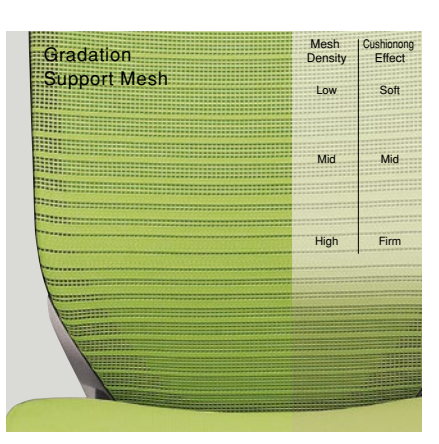
Gradation support mesh chairs with varying densities. The lower back area is made firmer for better lumbar support. The upper back area is less firm, offering more comfort.