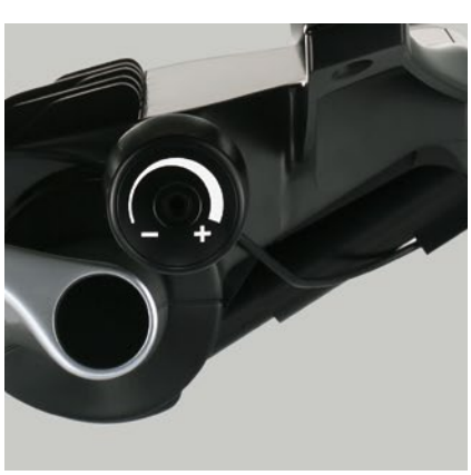
You can use the tension dial positioned underneath within easy reach of the right hand to finely tune reclining tension to your favorite setting.