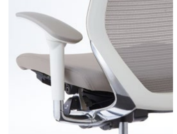
ody Color : White / Frame Color : Polished