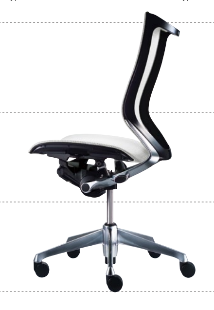
High Back without Armrest