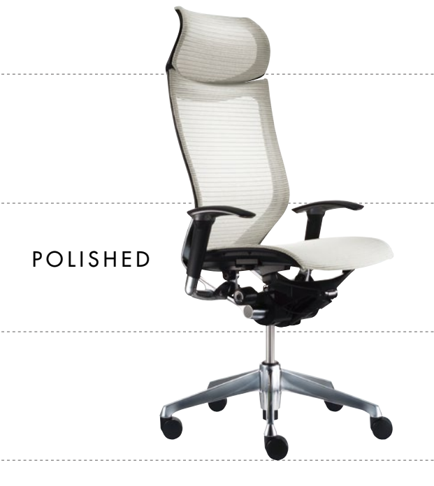
Extra High Back with Armrest