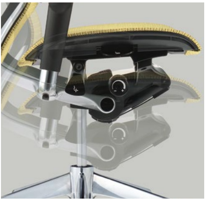
You can use the lever on the lower right to adjust the seat height up to 4inches(100mm).