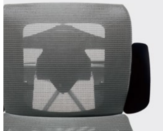
Seat Type : Mesl