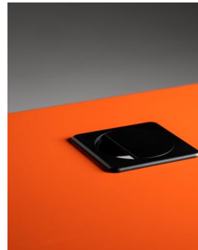
Grommets and media ports are an integral part of the product, • various types and configurations.