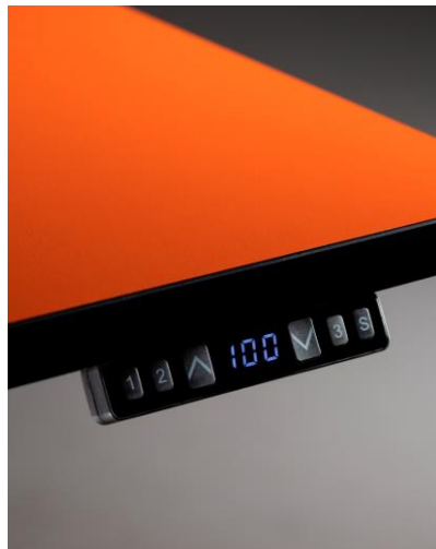
Control panel for eUP3 desks and workbenches, • with display and memory function.