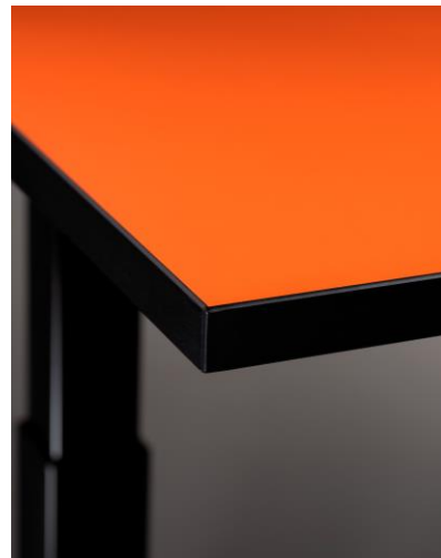
Table top made of melamine faced chipboard (MFC), with 2 mm edge or 3 mm glue or laser edge.