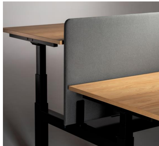
Upper desk panel for workbenches