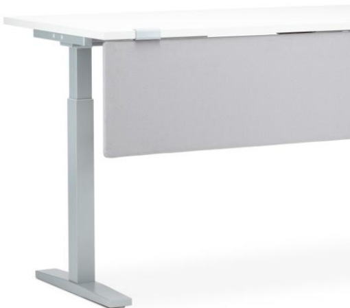
Modesty desk panel,