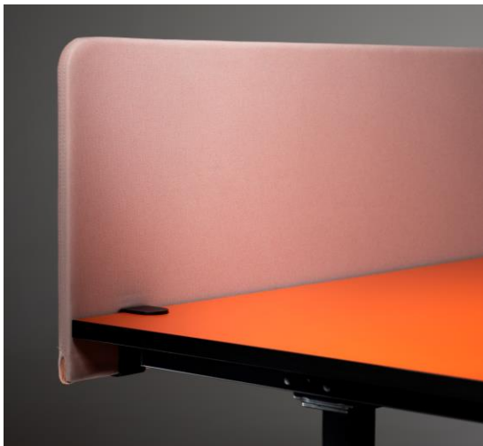
Upper desk panel, front